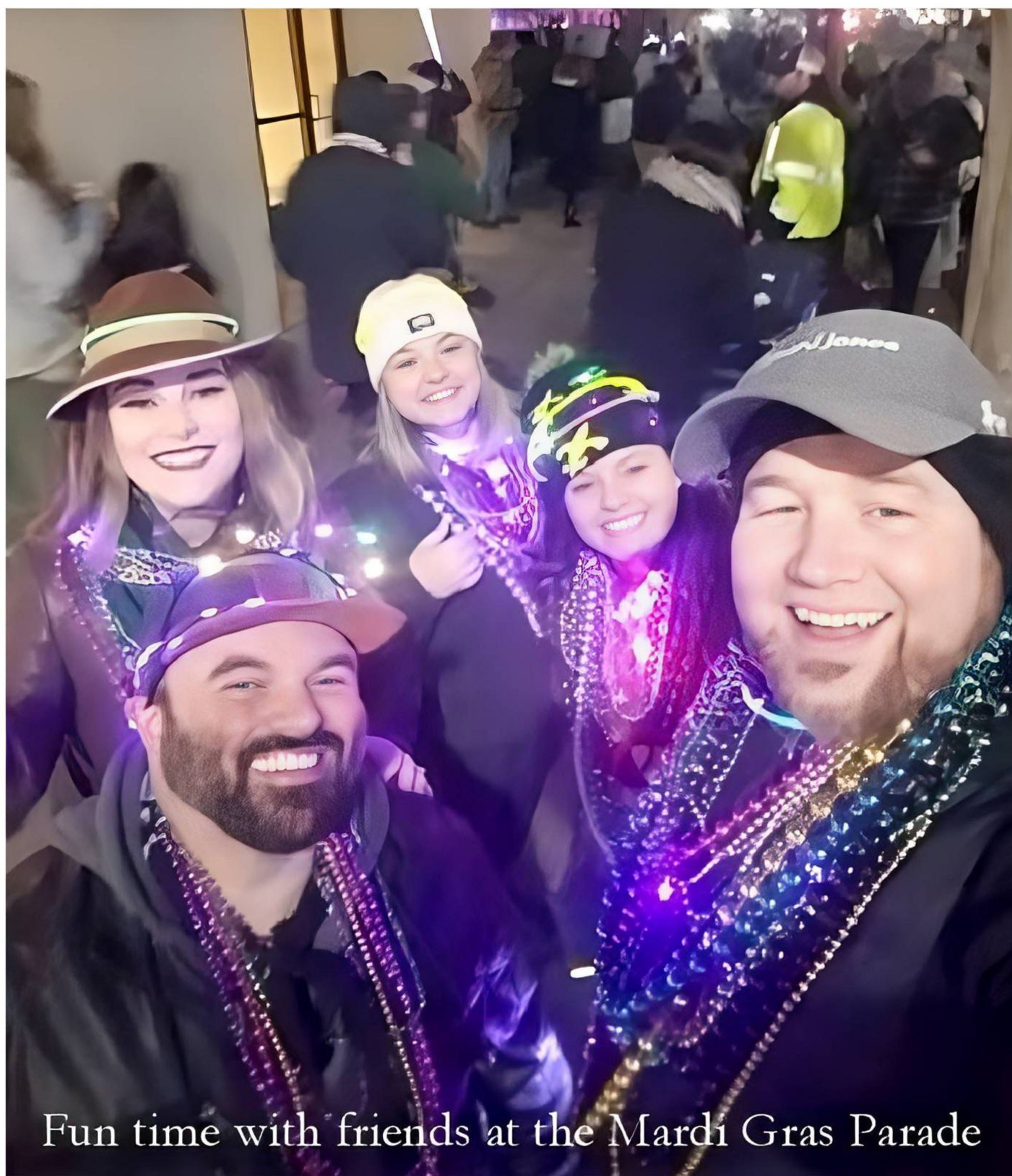
Fun time with friends at the Mardi Gras Parade

You will not often find our crew indoors, but when you do, we are usually gathered in our kitchen for potluck dinners or bonfires in our backyard. We also like celebrating holidays and seasonal activities with our local family - we are known for our annual Halloween Party and Christmas cookie decorating night! Many of our friends have children who cannot wait to support us on our journey.