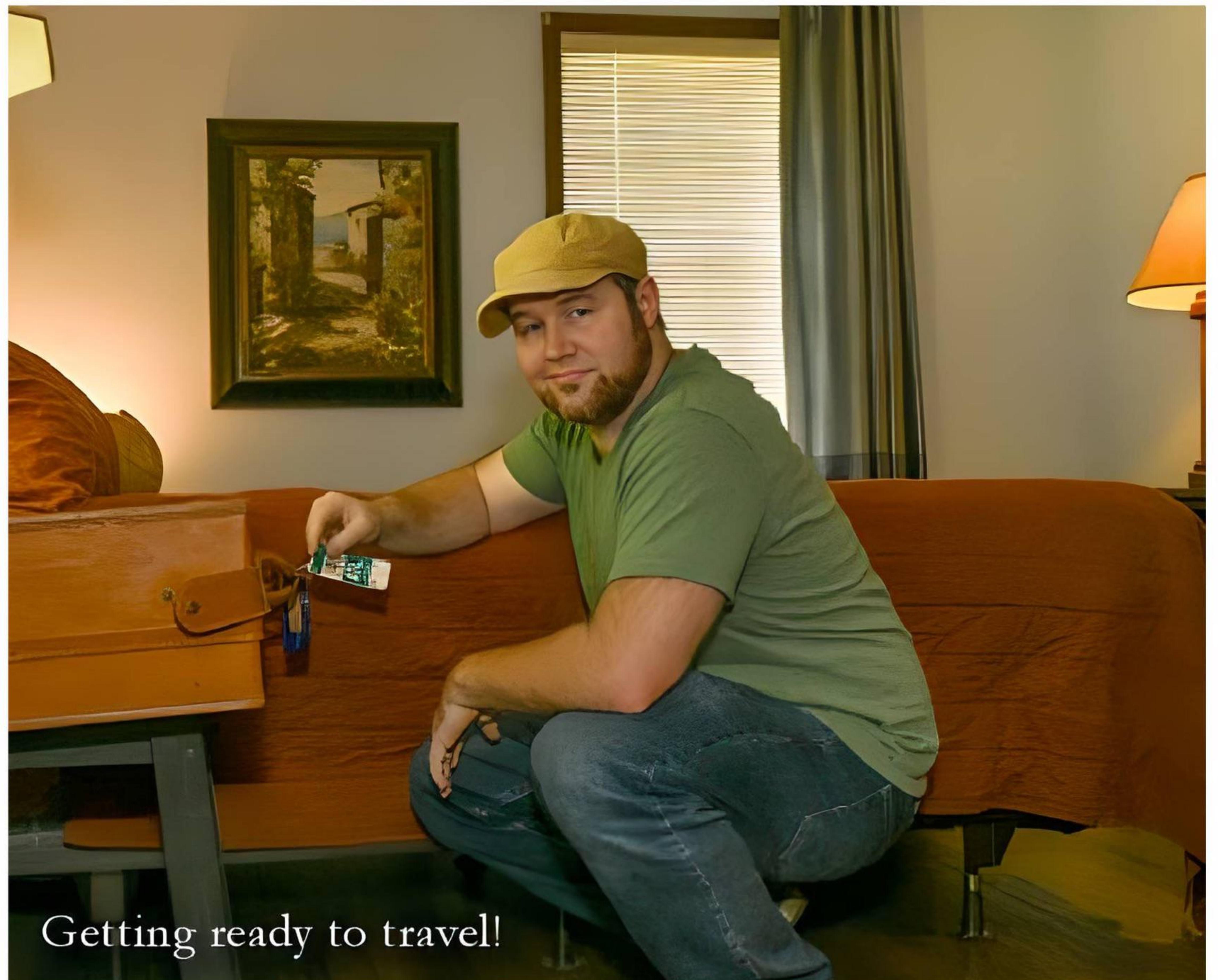
Getting ready to travel!