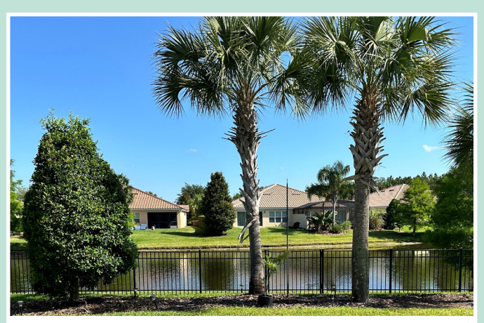
OUR BACK YARD