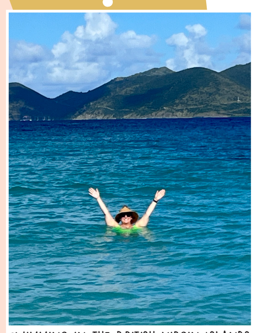
SWIMMING IN THE BRITISH VIRGIN ISLANDS

I was captain of the cheerleading squad in high school.