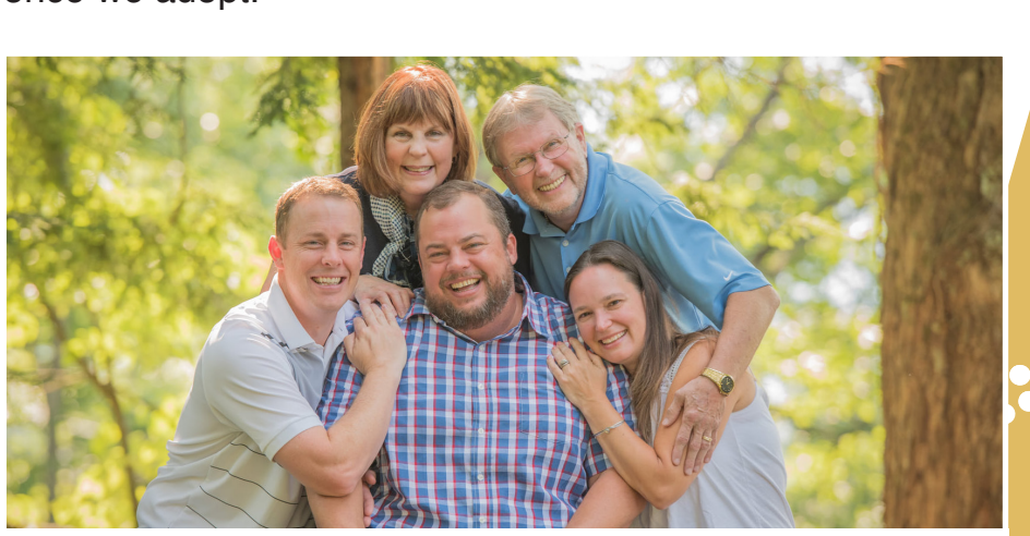
ANNUAL SUMMER TRIP

I work for a transportation technology company where I help build things that lead to safer streets and fewer accidents. My schedule is flexible, and I work from home. This will allow me the ability to care for a child and take them to any appointments. I look forward to six weeks of parental leave once we adopt.