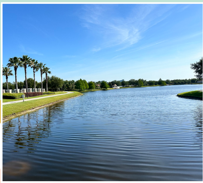
NEARBY LAKE AND WALKING TRAILS