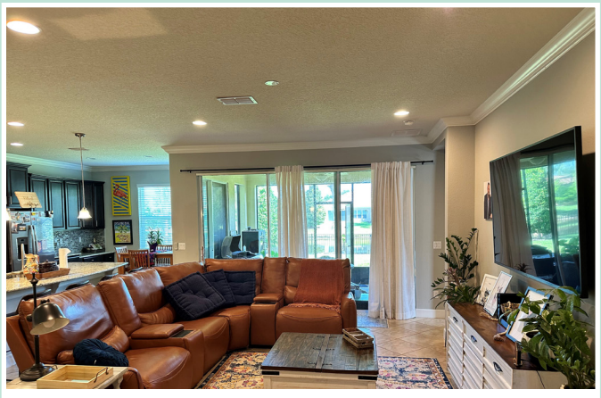
OUR LIVING ROOM

Our community boasts an array of family-friendly amenities and events, including playgrounds, two swimming pools, tennis courts, walking trails, a pickleball court, basketball courts, and food and ice cream trucks. We have a golf cart that we ride around in our neighborhood and the surrounding areas. We love driving our golf cart to the pool or the neighborhood deli. We are a short drive from world-renowned tourist attractions.