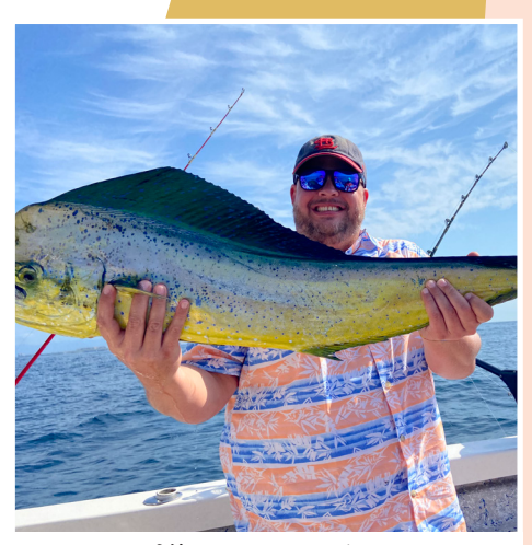
FISHING IN MEXICO