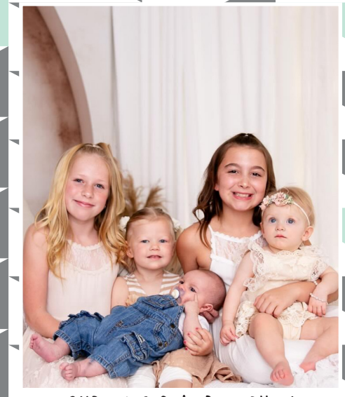
OUR NIECES AND NEPHEW

We are fortunate to live near supportive family members and close friends who enrich our lives with laughter, love, and shared experiences. Both of our parents and our siblings and their families all live locally. We have six nieces and two nephews who can't wait for a new playmate! We spend time with our family frequently. We attend family dinners, lots of birthday events, our nieces and nephews sporting events or plays and frequent Universal Studios and Disney World.