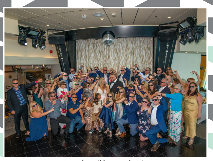
ONE BIG HAPPY FAMILY