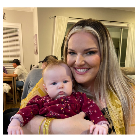
HANGING OUT AND SNUGGLING WITH MY NIECES

I grew up in South Florida on the beach. My favorite childhood memories were spending time with my siblings playing games, making forts, attending church, and going to the beach. We frequently went on cruises, which is one of my favorite things to do as an adult! As a child, I was a competitive swimmer, danced (tap, ballet, jazz), sang in choir, performed in plays and was a cheerleader for as long as I can remember.