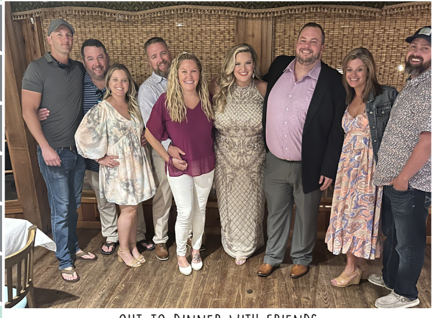
OUT TO DINNER WITH FRIENDS