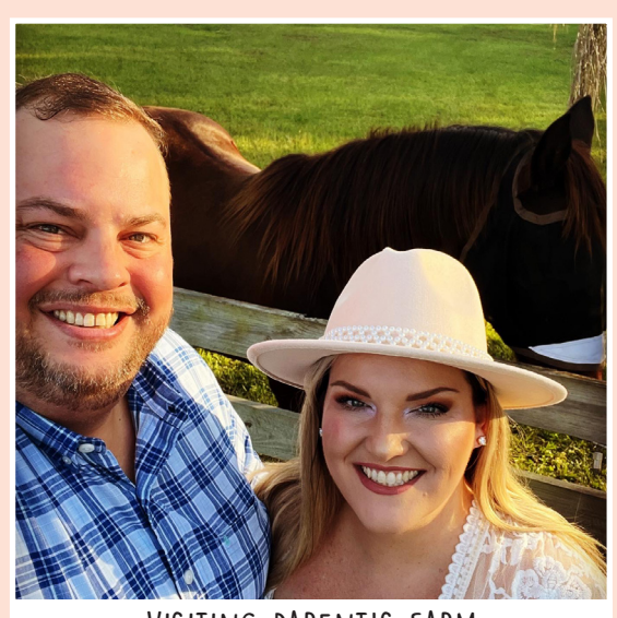
VISITING PARENT'S FARM