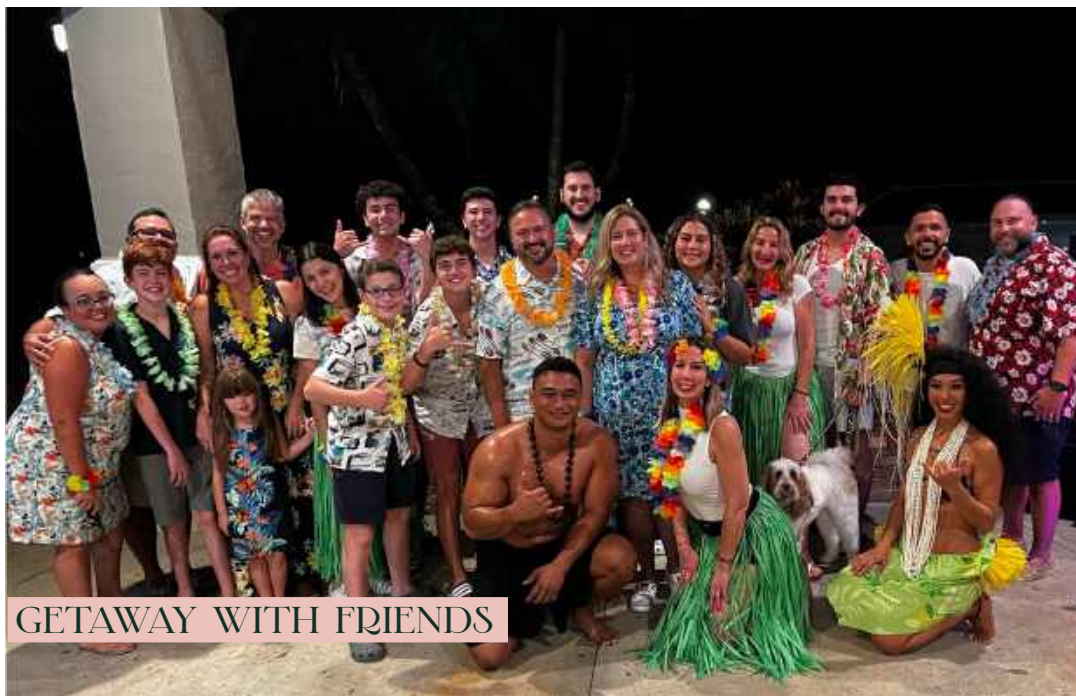
GETAWAY WITH FRIENDS