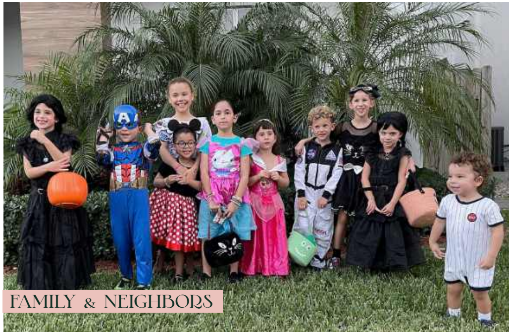
FAMILY & NEIGHBORS