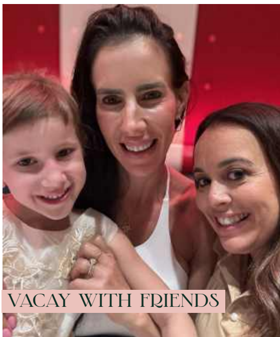
VACAY WITH FRIENDS