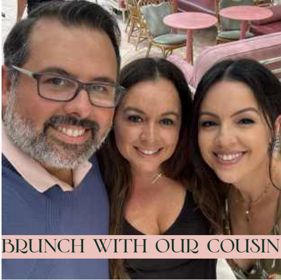
BRUNCH WITH OUR COUSIN