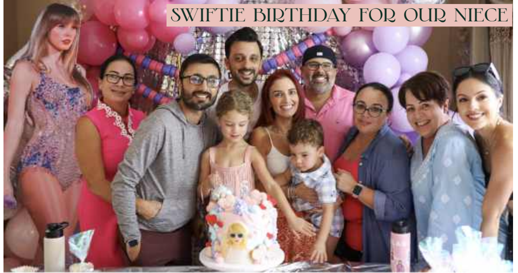
SWIFTIE BIRTHDAY FOR OUR NIECE