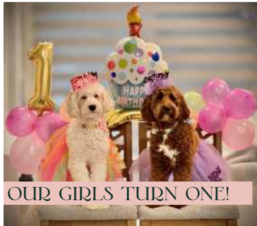
OUR GIRLS TURN ONE!