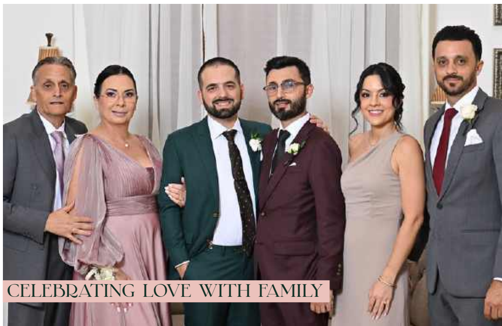
CELEBRATING LOVE WITH FAMILY