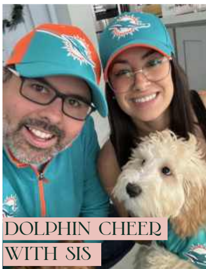
DOLPHIN CHEER WITH SIS