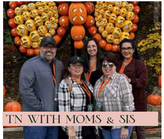
TN WITH MOMS & SIS