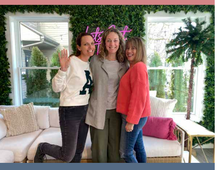
Celebrating grandma's birthday