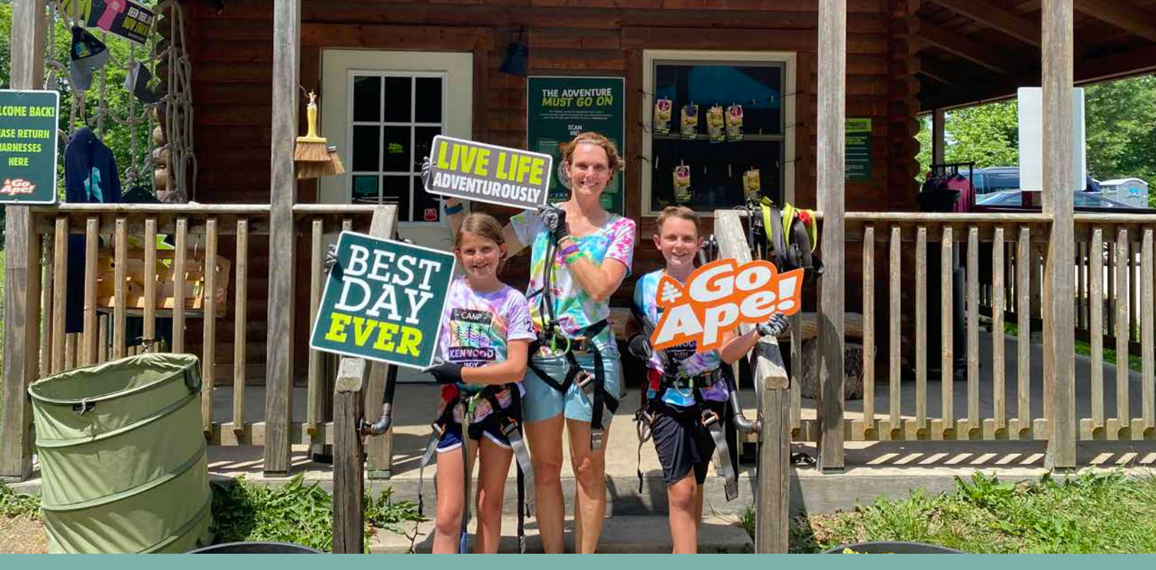
Ziplining adventure for summer camp