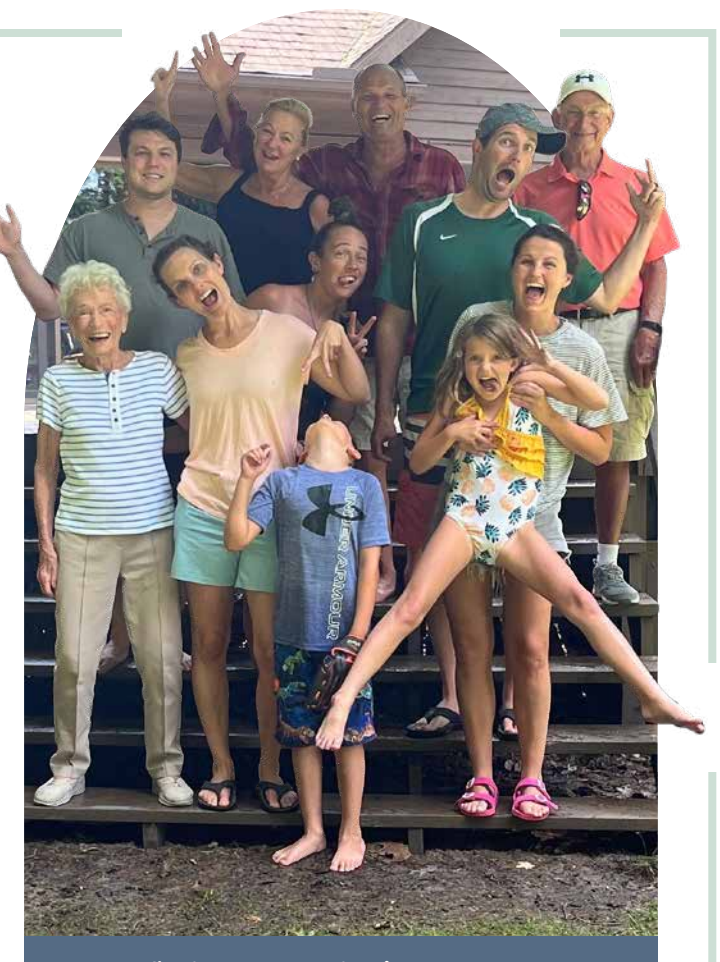
4<sup>th</sup> of July at our family lake house

I have a strong village around me that is ready and excited to welcome this child into their lives. Many friends that I've known since preschool, high school, and college live nearby and are part of my close circle.