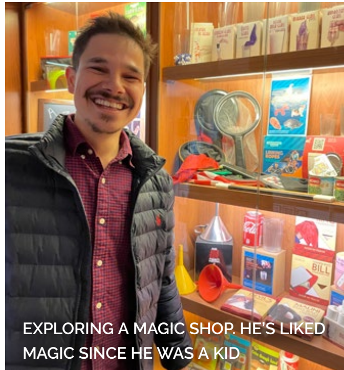
EXPLORING A MAGIC SHOP. HE'S LIKED MAGIC SINCE HE WAS A KID