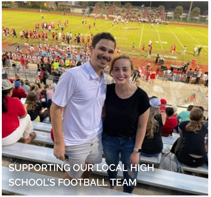
SUPPORTING OUR LOCAL HIGH SCHOOL'S FOOTBALL TEAM

Our home is filled with so much joy and laughter. We have a big, beautiful backyard, perfect for playing with our dog, and a spacious kitchen with a sign on the wall that reads, "This kitchen is for dancing." Our little cousins love hanging out at our house when they come to visit.