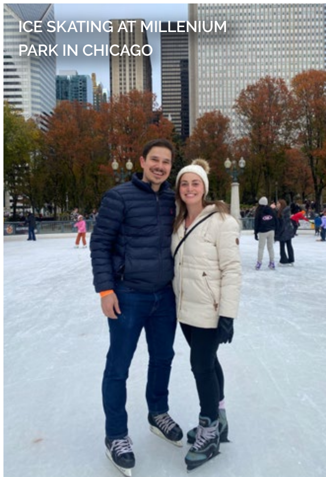
ICE SKATING AT MILLENIUM PARK IN CHICAGO