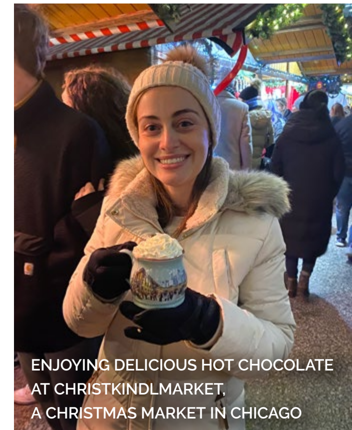
ENJOYING DELICIOUS HOT CHOCOLATE AT CHRISTKINDLMARKET, A CHRISTMAS MARKET IN CHICAGO