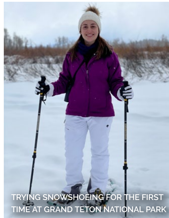
TRYING SNOWSHOEING FOR THE FIRST TIME AT GRAND TETON NATIONAL PARK

She’s amazing with our sweet dog, Cash. She takes care of him with love. They both wave to me from the porch every morning when I leave for work, and all I look forward to is coming back home and spending time with them. She’s made my life richer, and I can’t wait to see her as a mom, blessing a child’s life.