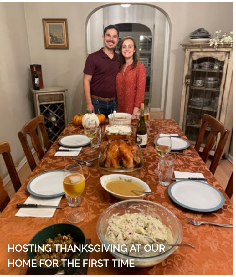
HOSTING THANKSGIVING AT OUR HOME FOR THE FIRST TIME