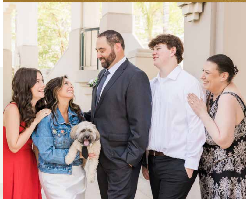
OUR FAMILY VISITS OFTEN, AND WE LOVE CAPTURING EVERY MEMORY!