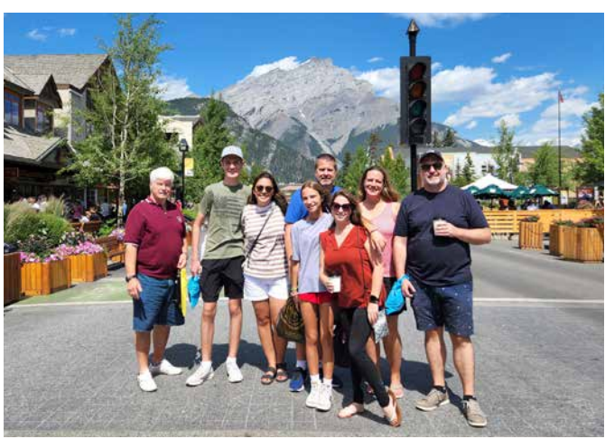
LIFE IS ABOUT CELEBRATING THE MOMENTS WE HAVE TOGETHER!