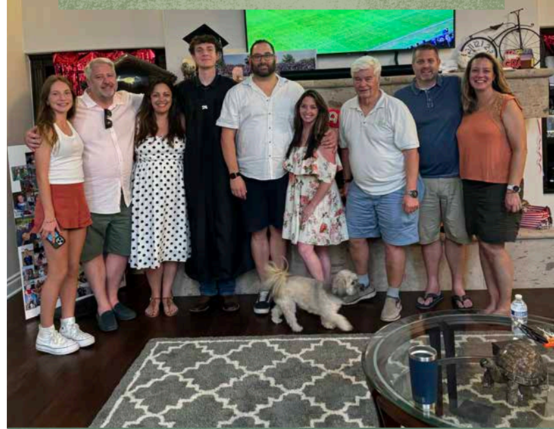
OUR NEPHEW’S HIGH SCHOOL GRADUATION IN TEXAS - WE ALWAYS MAKE TIME TO CELEBRATE BIG EVENTS!