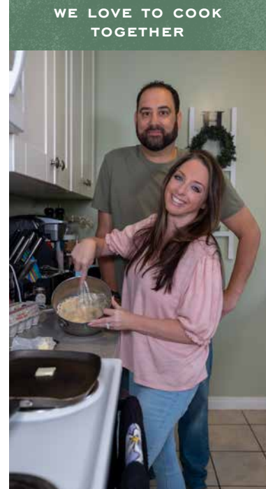
WE LOVE TO COOK TOGETHER