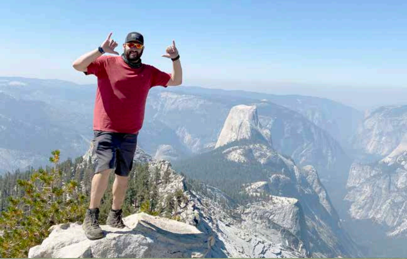
CLIMBED TO THE MOUNTAIN TOP!