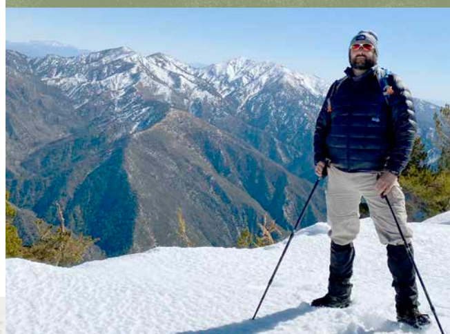
NATURE FILLS MY SOUL!

Growing up I played basketball, baseball, soccer, and football, which taught me values I hope to pass on like accountability, respect, and the importance of teamwork. My favorite childhood memory is fishing with my dad at our local reservoir; we didn't catch much, but those moments taught me a lot especially things I'd only appreciate later in life. I hope to be a father like him—to teach life lessons, celebrate wins, and more importantly to support my child through the losses by teaching resilience and self-belief.