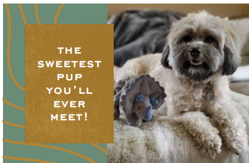
THE SWEETEST PUP YOU'LL EVER MEET!