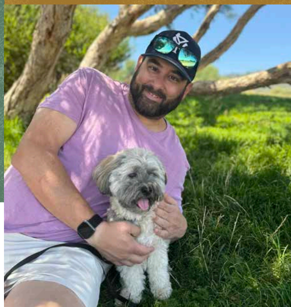
PICNIC WITH BRODY BEAR

ORIGINALLY FROM THE EAST COAST, I'M A CITY BOY AT HEART WITH A LOVE FOR THE OUTDOORS.