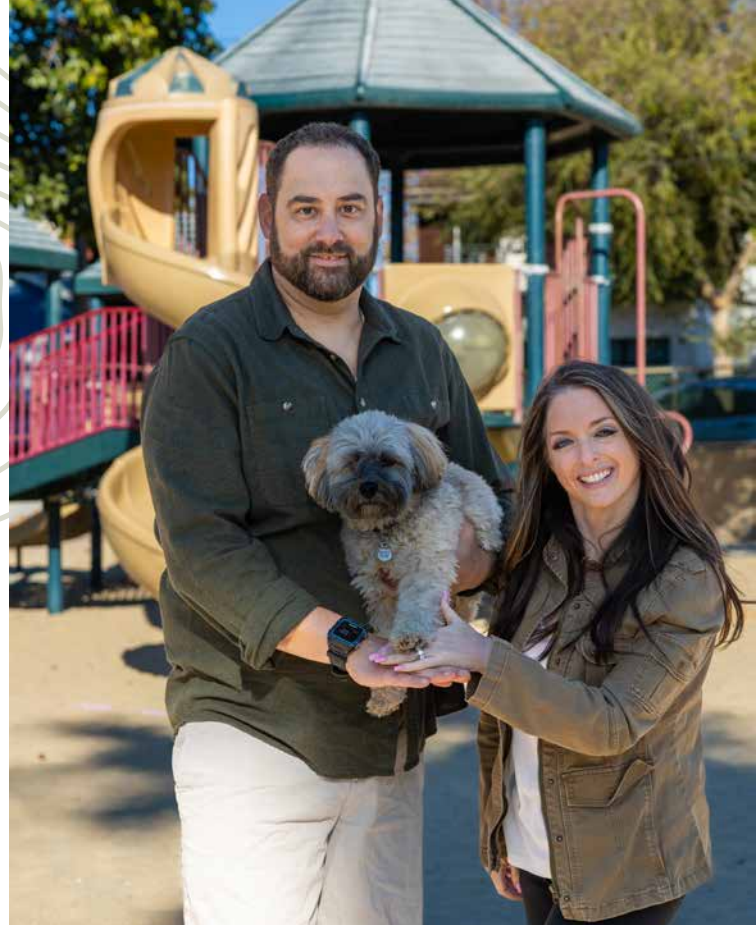
CAN'T WAIT TO TAKE OUR LITTLE ONE TO THE PLAYGROUND!

With festivals, outdoor concerts, BBQs, beach days, hikes, game nights, and so many playgrounds, it's full of life and adventure. We both individually chose this town from across the country before even meeting and we're so grateful for it. There are endless activities for kids here, from sports to volunteering to movies on the beach allowing creativity and interests to blossom. We love exploring new places, whether it's the desert, western towns, or our favorite mountains. Spending time in nature is a core part of our family culture—hiking, fishing, bird watching, paddle boarding with sea lions or just enjoying sunsets with a kind word to ourselves or others. We're always seeking new adventures and finding ways to immerse ourselves in the world outside of technology.