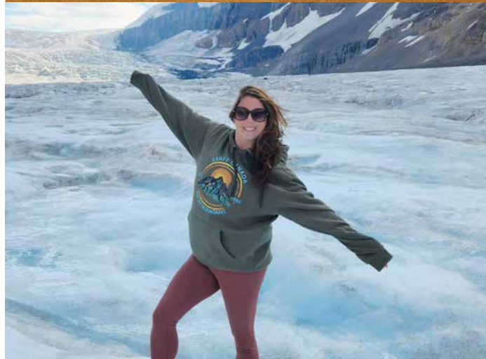
CHALLENGING MYSELF TO GROW THROUGH NEW EXPERIENCES

“ I CAN'T WAIT TO BE A MOTHER AND TO SHARE THIS JOURNEY OF LOVE, GIGGLES, AND GROWTH WITH MY HUSBAND AND YOUR LITTLE ONE. ”