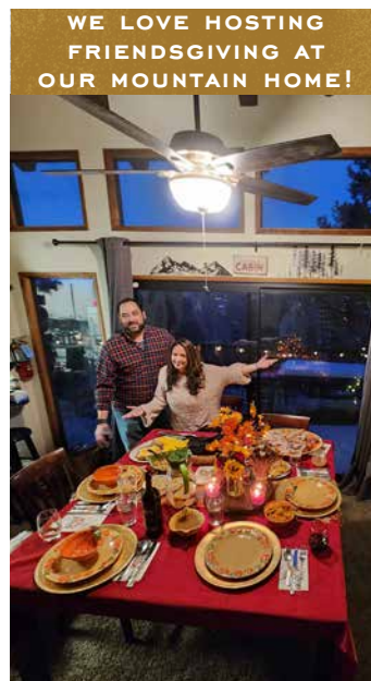
WE LOVE HOSTING FRIENDSGIVING AT OUR MOUNTAIN HOME!