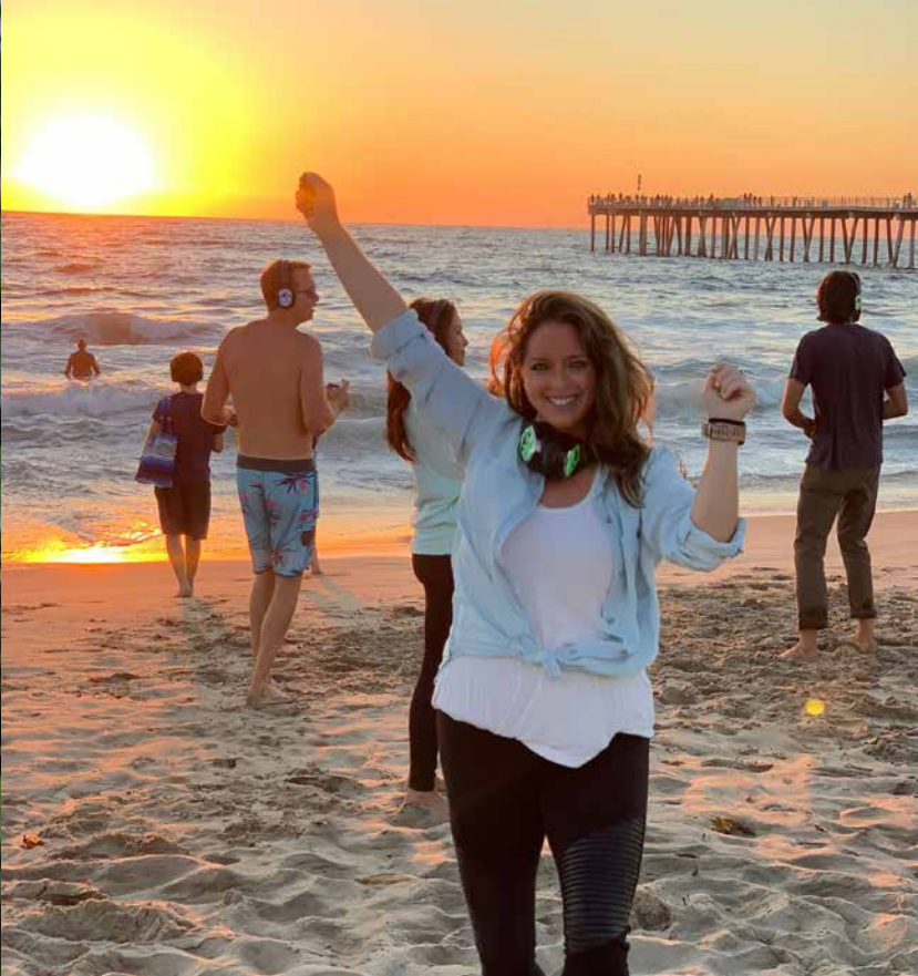
ALWAYS HAVING A GOOD TIME!