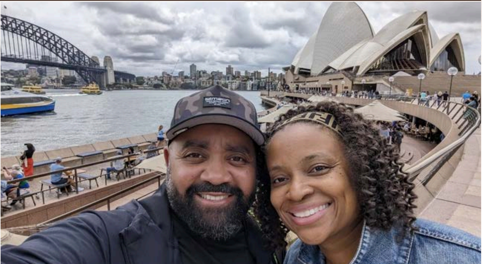
Exploring Sydney, Australia

Thank you for taking the time to explore our lookbook! We are thrilled to be expanding our family. Our hearts are filled with joy to know that we have an opportunity to grow together as a family.