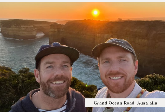
Grand Ocean Road, Australia