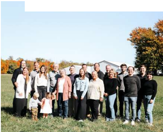
GARY'S SIDE OF THE FAMILY