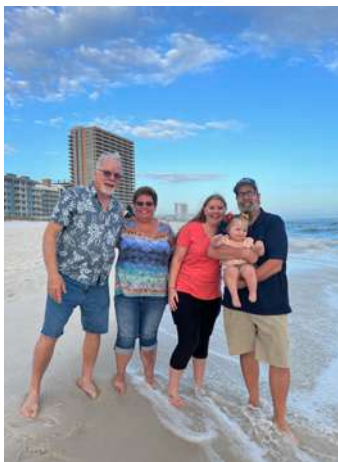
WE LOVE FAMILY VACATIONS