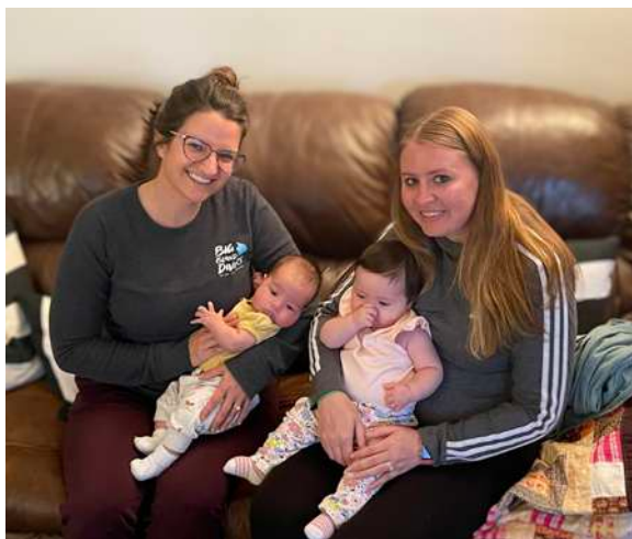
CATCHING UP WITH A GOOD FRIEND WHO IS ALSO AN ADOPTIVE MOM