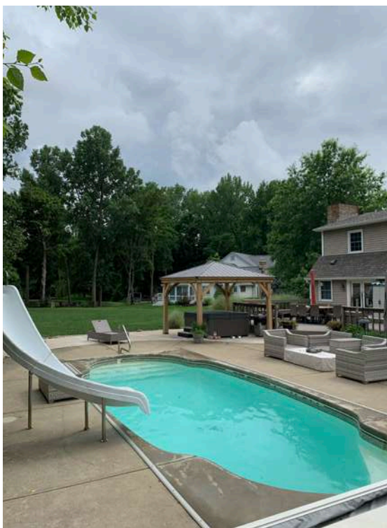
OUR BACKYARD WE CALL "THE O'ASIS"

Our charming two-story home sits on a quiet cul-de-sac surrounded by wonderful neighbors with whom we are very close with. It features an in-ground pool, a wooden play set, a sandbox, an inflatable bounce house with water slides, canons and splash zone, a hot tub, and a private pond for fishing. It's truly a perfect home for family fun. The spacious yard is great for our rescue pups, Kora and Kira, and a safe haven for children to learn, grow, and flourish.