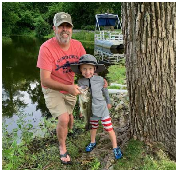
WHAT A CATCH! FISHING IN OUR POND WITH OUR COUSIN'S SON