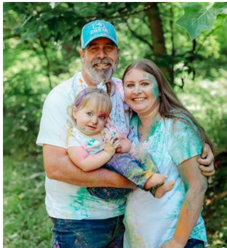
COLORFUL FAMILY FUN