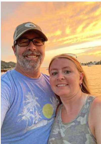
SUNSET AT THE LAKE

Even with all our adventures, home is our favorite place. We love hosting pool parties, cookouts, and holidays with family and friends. We're so thankful for this life and can't wait to share it with another child.