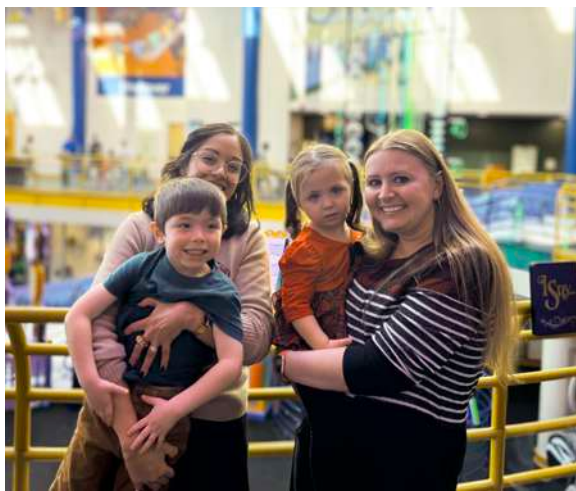
WITH A FRIEND AND HER SON AT THE CHILDREN'S MUSEUM