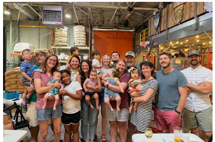
GET TOGETHER WITH OUR GOOD FRIENDS AND FELLOW ADOPTIVE FAMILIES