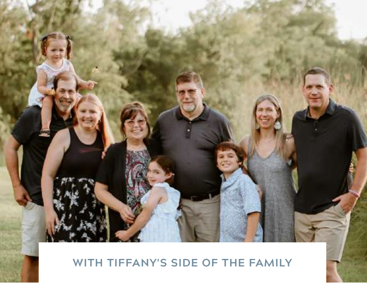
WITH TIFFANY'S SIDE OF THE FAMILY