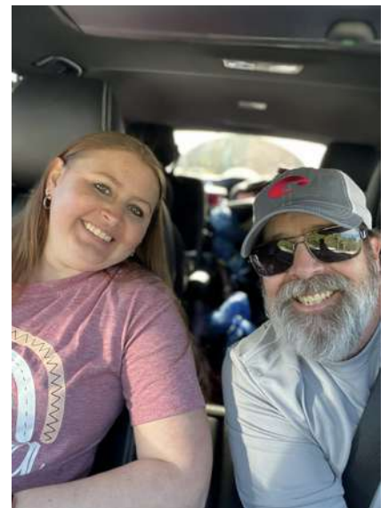
CAR PACKED AND HEADED OUT ON VACATION