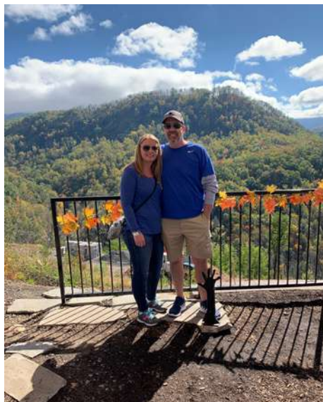
GREAT VIEWS AT GATLINBURG