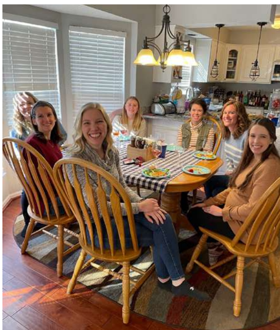
BRUNCH WITH OTHER ADOPTIVE MOMS! SHARING LAUGHS, SUPPORT, AND THE JOURNEY