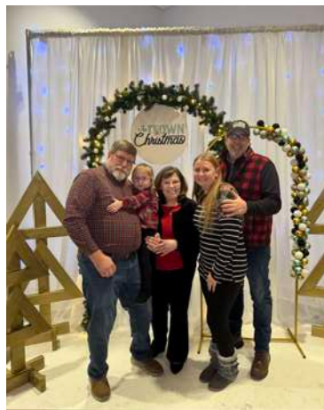
CHRISTMAS EVENT IN TOWN