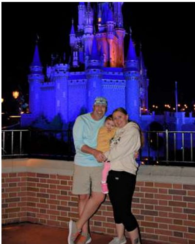
WHERE DREAMS COME TRUE