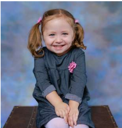
PRESCHOOL PHOTO DAY