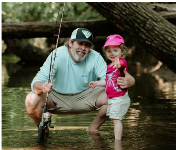
DADDY DAUGHTER FISHING