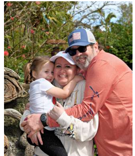
LOVE MADE US A FAMILY, ADOPTION MADE US THREE