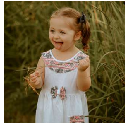
SWEET AND SILLY