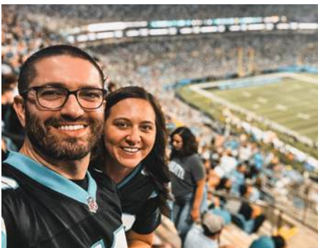
Although the seasons often end in heartbreak, we are proud Carolina Panthers fans!