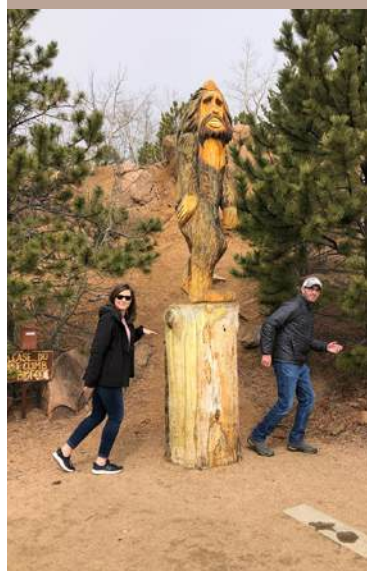
Searching for Bigfoot at Rocky Mountain National Park in Colorado