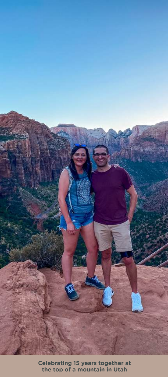
Celebrating 15 years together at the top of a mountain in Utah