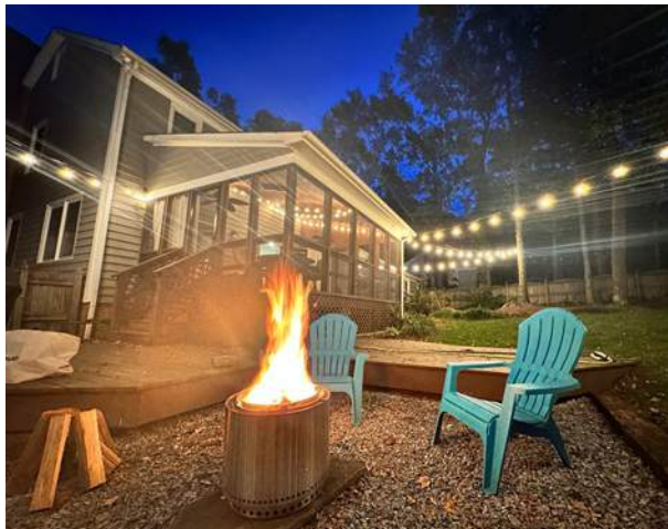
We love hosting friends and ending the night by the fire pit laughing and telling stories

Our home is a three-bedroom charmer that instantly felt like us especially when we saw the backyard. It's our happy place, complete with a screened-in porch, playset, and fire pit where we gather with friends on the weekends or even after a long day. We can already picture pushing a little one on the swing or reading a book to them on the porch. One of our favorite compliments came from a friend who said, "It just feels like a hug when you walk in."