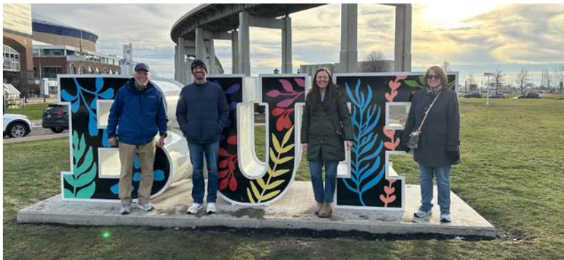
My parents sparked my love for travel early on — they showed me the joy of exploring new places.