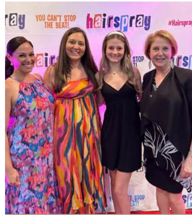
Every spring, the girls see a musical—a tradition that's all theirs