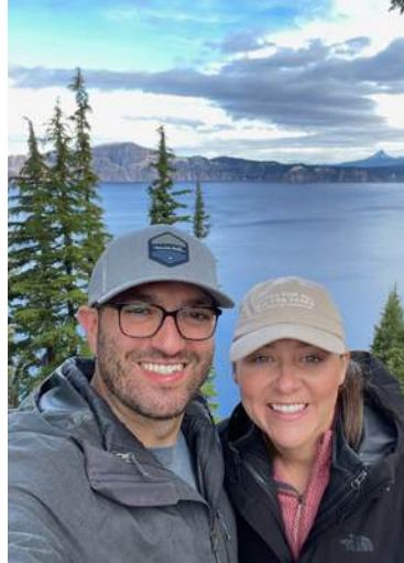
27 National Parks & counting - our happiest days are spent on the trail!