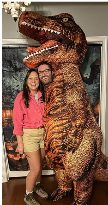
Dressed up as Jurassic Park for Halloween

We look at life as a team sport, always working together and supporting one another. We can't wait to add a little one to the team.