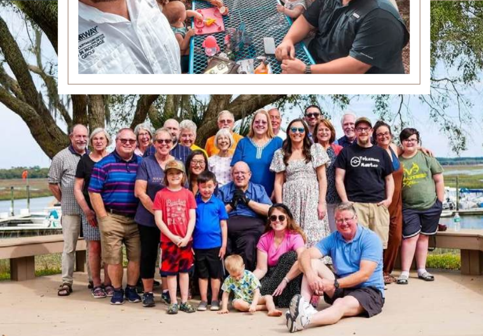
Whether it's our close friends, or extended family, we love making memories at the beach!