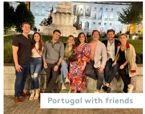
Portugal with friends