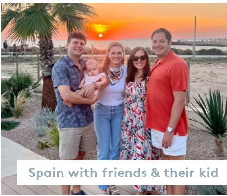
Spain with friends & their kid