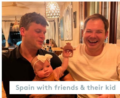
Spain with friends & their kid