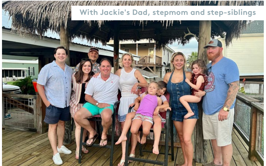
With Jackie's Dad, stepmom and step-siblings