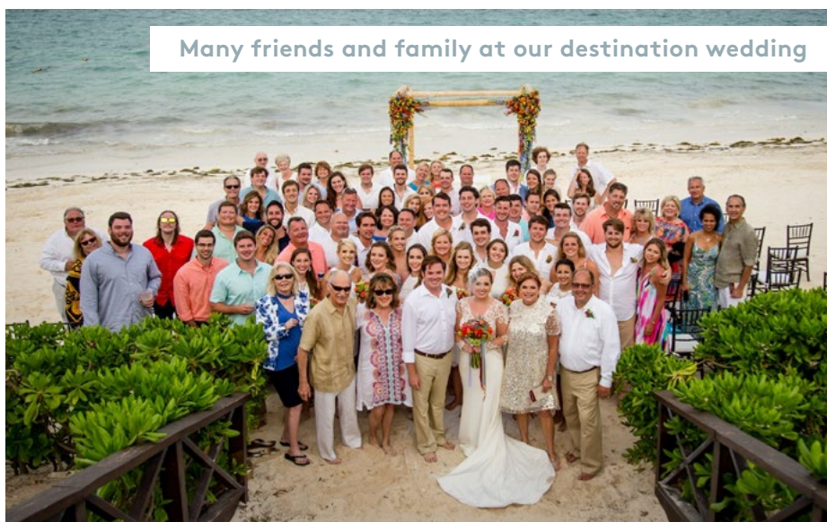
Many friends and family at our destination wedding