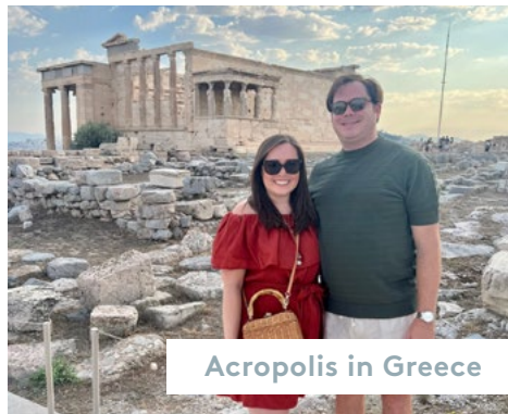
Acropolis in Greece