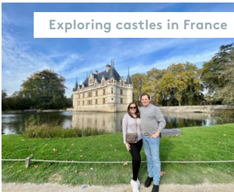
Exploring castles in France