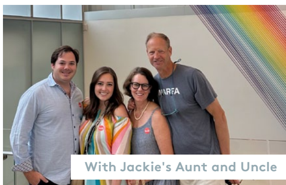
With Jackie's Aunt and Uncle