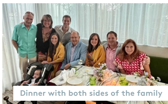
Dinner with both sides of the family