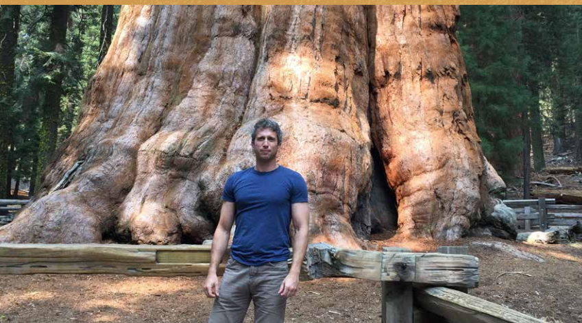
EXPLORING AMONG THE GIANT REDWOODS