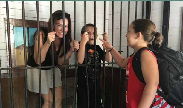
CLOWNING AROUND WITH OUR FRIENDS' CHILDREN