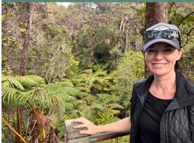
WE BOTH ENJOY HIKING TOGETHER