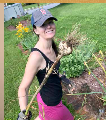
SHE LOVES GARDENING AND PLANTS