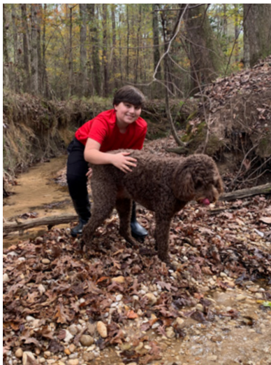
Scenic walks with my cousin and Lottie