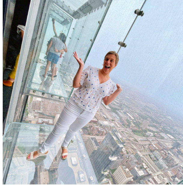
Chicago views at the top of Willis Tower