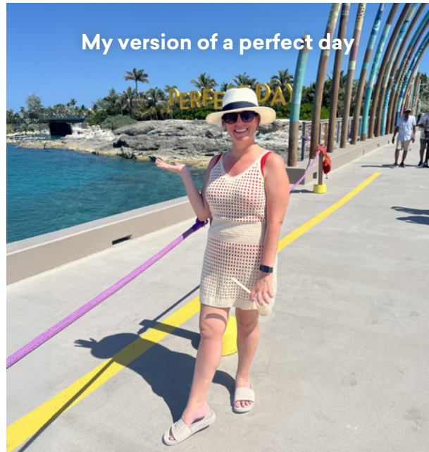
My version of a perfect day