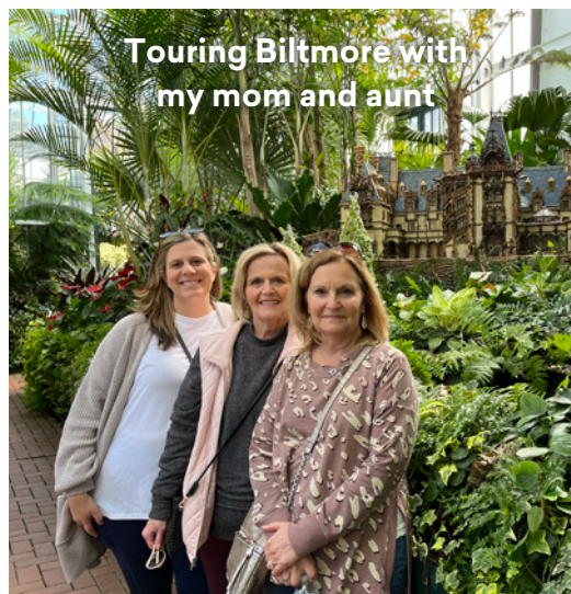
Touring Biltmore with my mom and aunt