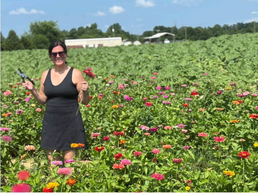
Gardener heaven in a field of wildflowers