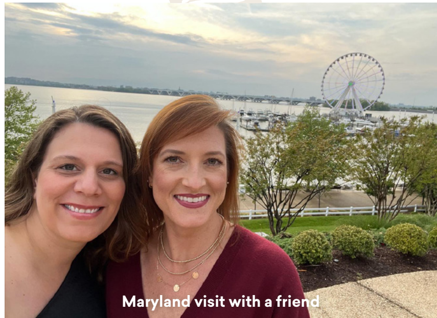
Maryland visit with a friend