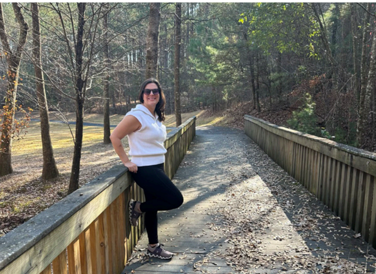
Beautiful walking trails