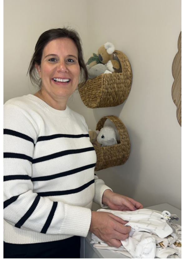
The nursery is ready!

Fostering taught me patience, resilience, and advocacy. It helped me understand trauma and the importance of creating a safe, steady, predictable home. It showed me how much love I had to give and how natural it was for me to step into nurturing and caretaking. It also helped me see the value of supporting birth families, and I'm grateful that I still have a relationship with my foster son and his family. We exchange pictures and holiday updates, and that connection will always mean something to me. My family embraced him as their own—from babysitting and dropping meals by to gathering up last-minute baby items without being asked. Their support made me realize how ready they are to welcome a child through adoption as well. Fostering shaped the parent I hope to be: grounded in empathy, steady in structure, gentle in patience, rooted in faith, and committed to honoring each child's unique background and story. It confirmed the deep desire of my heart—to become a mother and provide a home full of safety, love, and belonging.