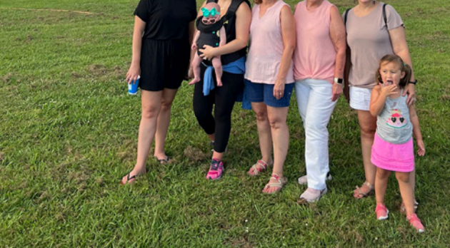
We had a lot of fun at a hot air balloon festival