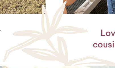
Love attending my cousin's dance recitals