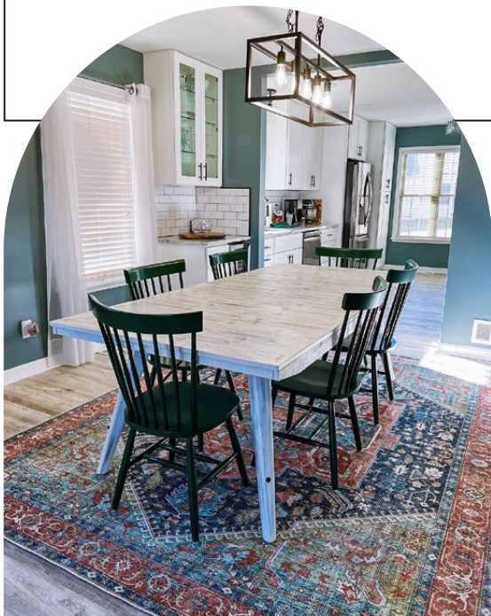
Dining room big enough for all family to enjoy a meal

We live in a welcoming small town just outside of Columbus, Ohio, where quiet streets, open spaces, and a strong sense of community create a feeling of comfort and connection.