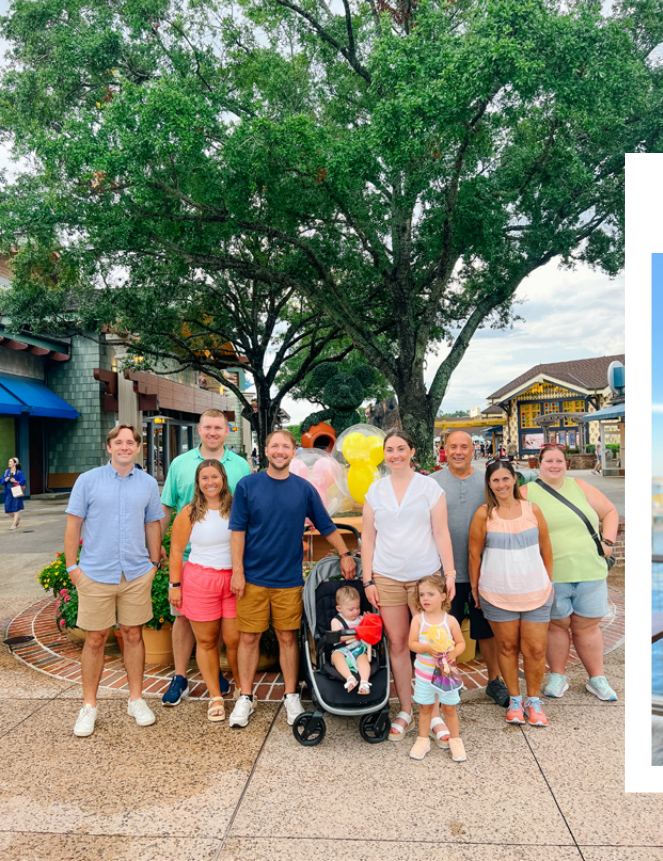
We love Disney!