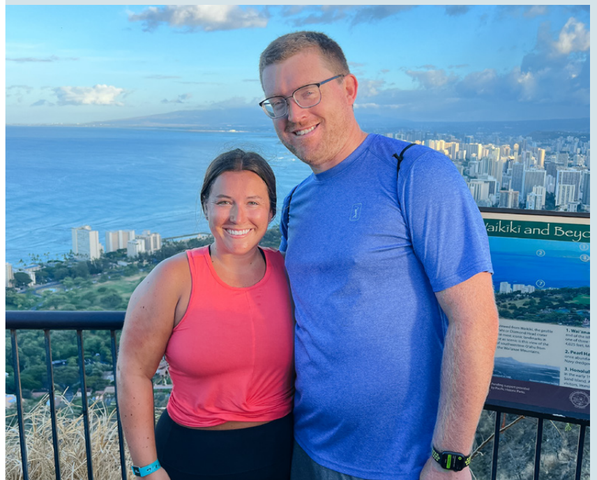
Sunrise hike on Diamond Head in Hawaii