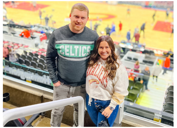
A house divided! Cavs vs. Celtics

We want you to know that we will always honor your role in their story. Your bravery will never be forgotten and will always be spoken about with gratitude and respect. We are so excited to grow our family through adoption, and if we are chosen, we will be welcoming not just a child into our hearts, but the beginning of a story that forever connects us to you.