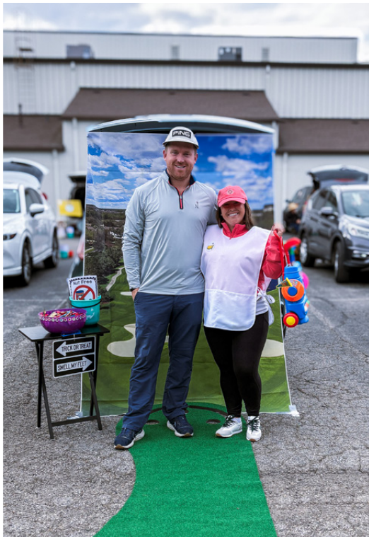
Golf themed Trunk-or-Treat at our church

The part of our life we are most excited to share with a child is the love, stability, and joy we've built together. We can't wait to include them in our traditions, celebrate milestones, and create new memories as a family. From everyday routines like walks and bedtime stories to holidays, trips, and simple time at home, we are so excited to experience it all together.