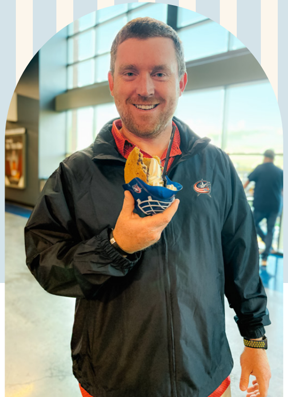
Love a good sweet treat!

I enjoy golfing with friends and family, working on small projects around the house, watching sports, and country concerts