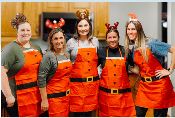
Christmas cookie baking crew

Family is at the heart of who we are, and we feel incredibly blessed to be surrounded by a strong, loving, and supportive system.