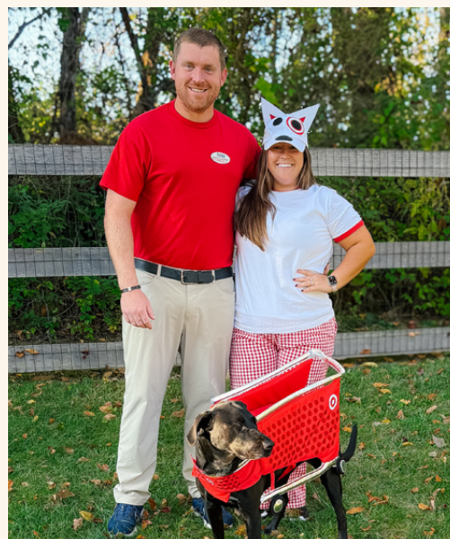
Target themed birthday for Birdie