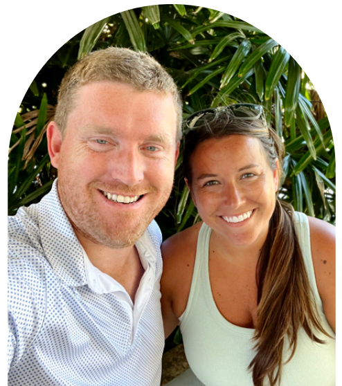
Visiting Pearl Harbor