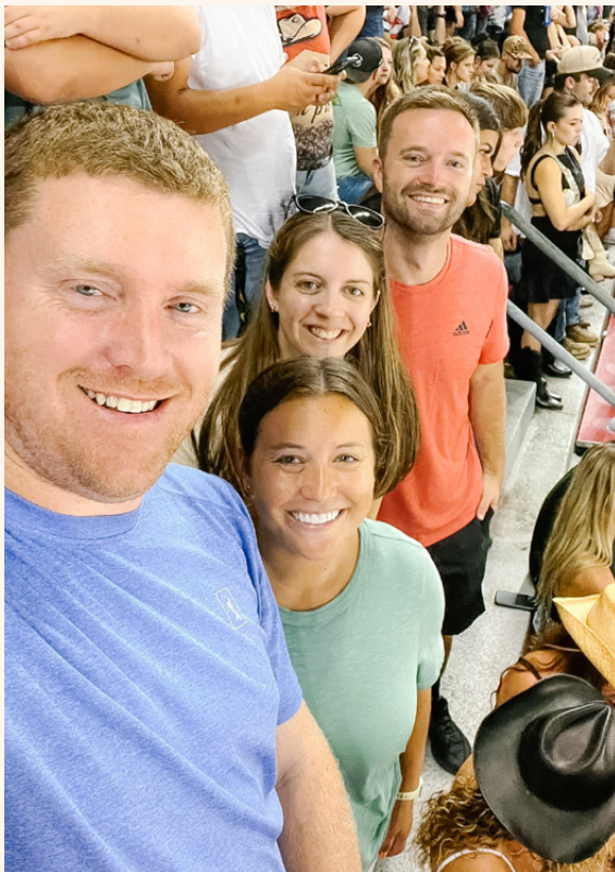
Country concerts with our good friends

Whether it's date nights, concerts, trips, or simple evenings together, they bring laughter, encouragement, and fun into our lives. They've been part of our journey and are excited for what's ahead. We know our child will be surrounded by people who will show up, cheer them on, and help create a life full of love and connection.