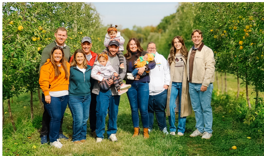
Annual family apple picking tradition