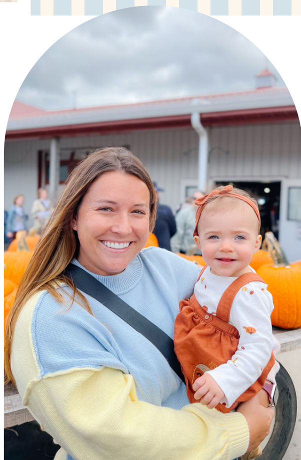
Pumpkin patch with our niece

They've shown us the joy of seeing the world through a child's eyes, and it makes us even more excited for parenthood. We can't wait for our child to grow up surrounded by cousins and for us to pour that same love, fun, and encouragement into our own family.