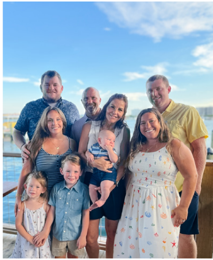
Traveling with family