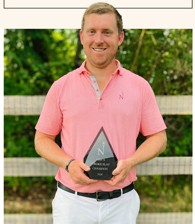
Honored with a golf trophy

I hope to guide, support, and cheer on our child as they grow into their best self.