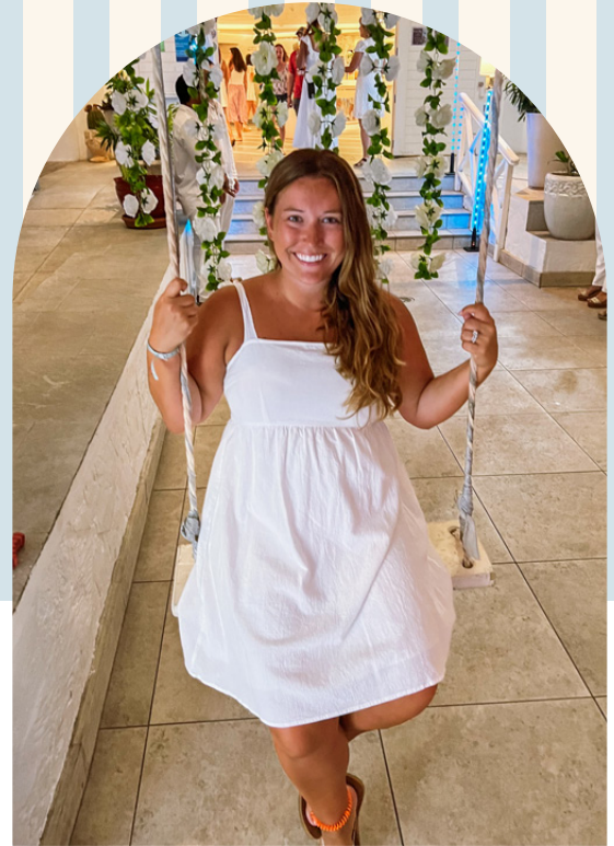
Hanging out before dinner on vacation