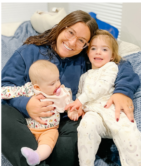
Cuddle time with Aunt Victoria