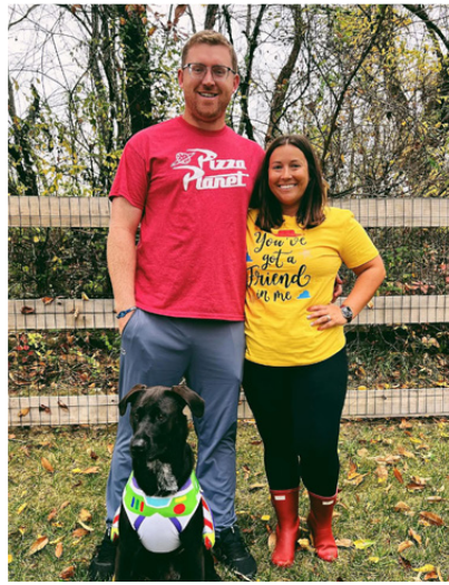
Toy Story themed birthday for Birdie

Adoption feels like the path we were always meant to walk.