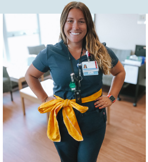
The life of a nurse! Fall risk gait belt

I began my career as a bedside nurse, inspired by my mom, and today I'm a nurse manager who loves what I do. Caring for others and supporting people through both challenges and victories is incredibly meaningful to me. Family has always been at the center of my life. I cherish our traditions, staying close with my extended family, and being an aunt to my nieces and nephews. Watching them grow and explore the world has been one of my greatest joys. For as long as I can remember, I've dreamed of being a mom, and I can't wait to share traditions, everyday laughter, and unconditional love with a child who will know just how cherished they are.