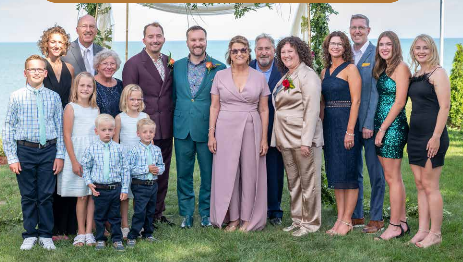
BOTH SIDES OF THE FAMILY GATHERED TOGETHER FOR OUR WEDDING