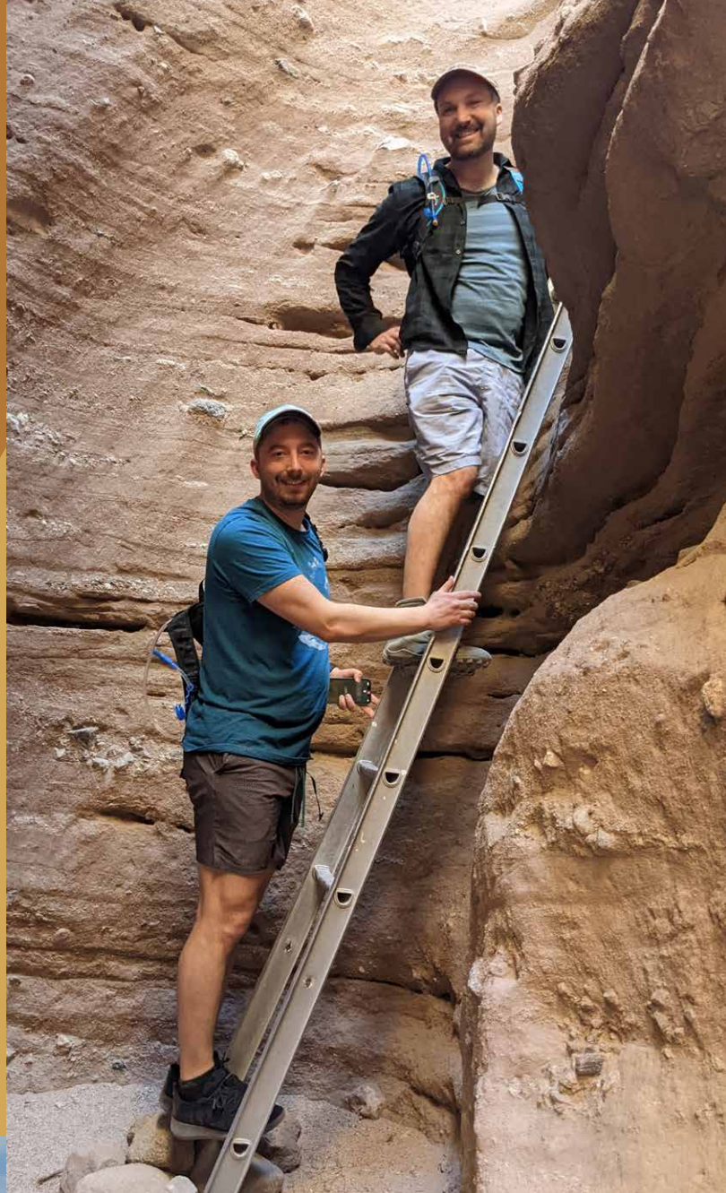
ON THE LADDER CANYON HIKE IN PALM SPRINGS, CALIFORNIA