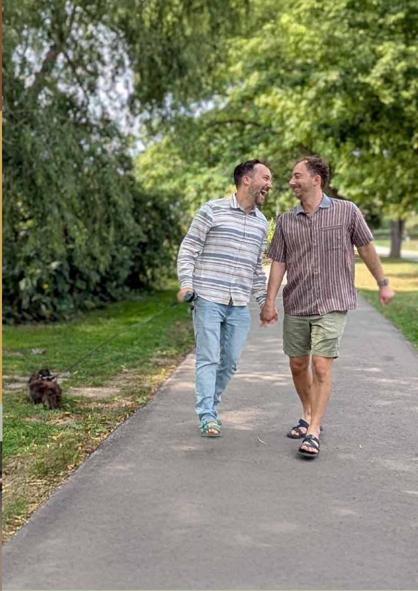
WALKING PEACHES IN THE PARK NEAR OUR HOME