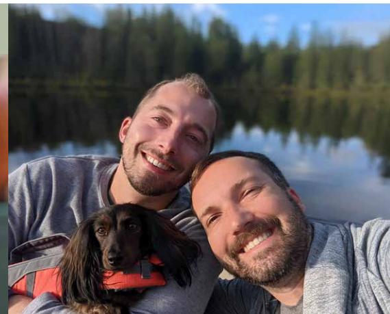
PEACHES NAPPING IN THE SUN