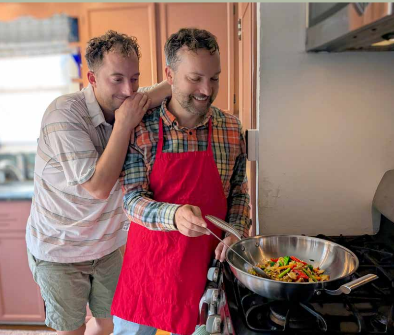
COOKING DINNER IN OUR KITCHEN