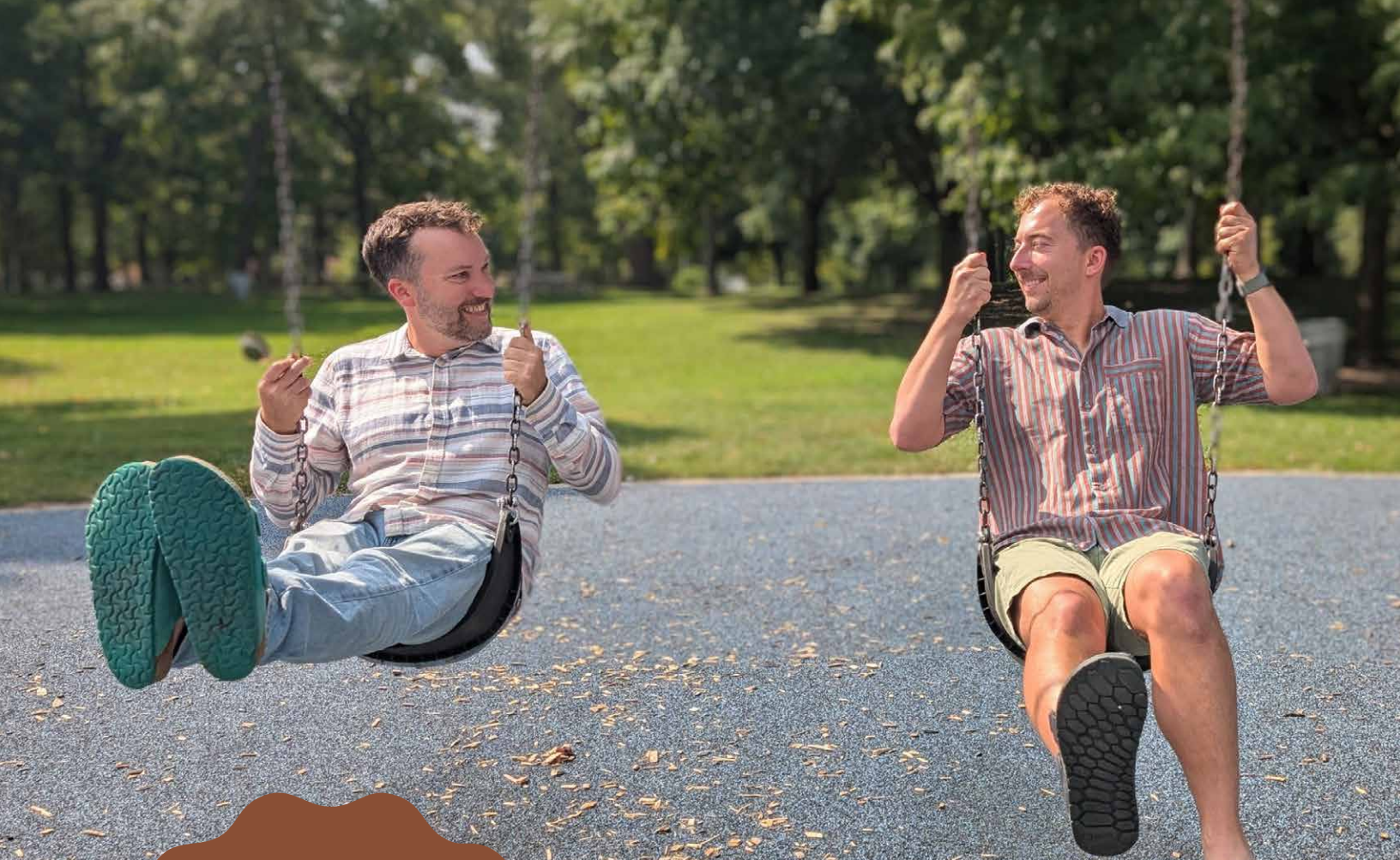
ON THE SWINGS AT A PLAYGROUND NEAR OUR HOME