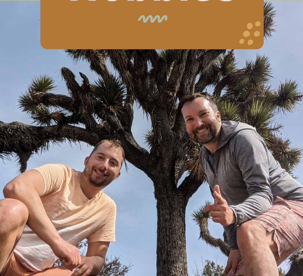
HIKING IN JOSHUA TREE NATIONAL PARK