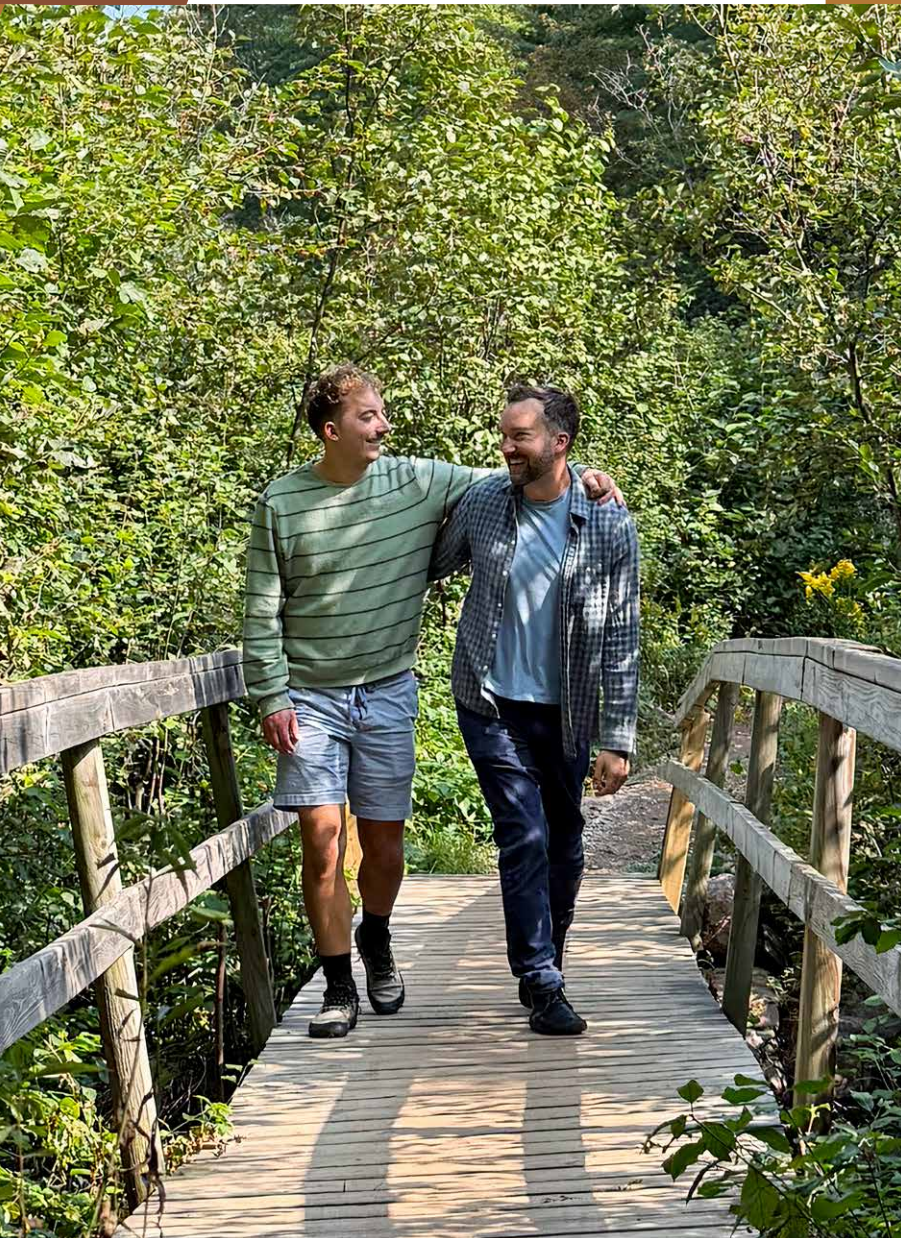
ON ONE OF OUR FAVORITE HIKES IN MICHIGAN