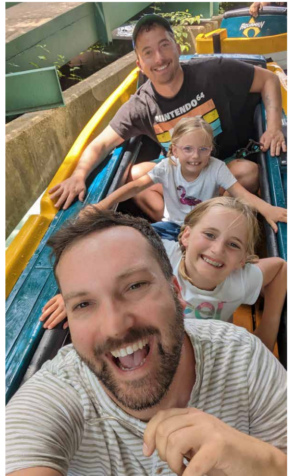
RIDING A LOG FLUME WITH OUR NIECES

Becoming parents means sharing our lives and building a home filled with love, laughter, and family traditions.